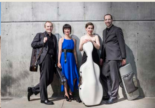
Jasper String Quartet