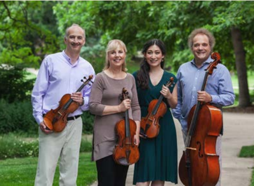
Takács Quartet

Beethoven — Quartet in C-sharp minor, Op. 131