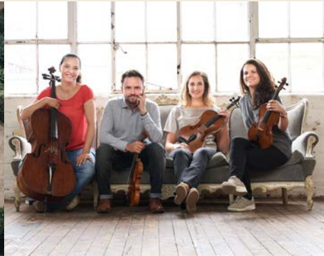
Concerto Italiano