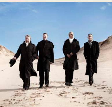
Emerson String Quartet

Beethoven — Quartet in E-flat Major, Op. 127