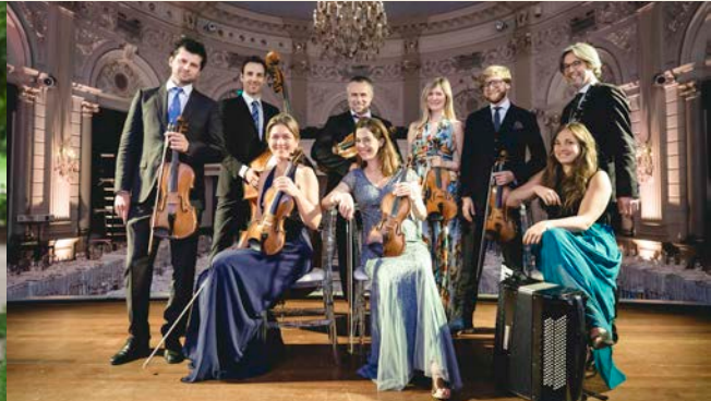
Camerata RCO