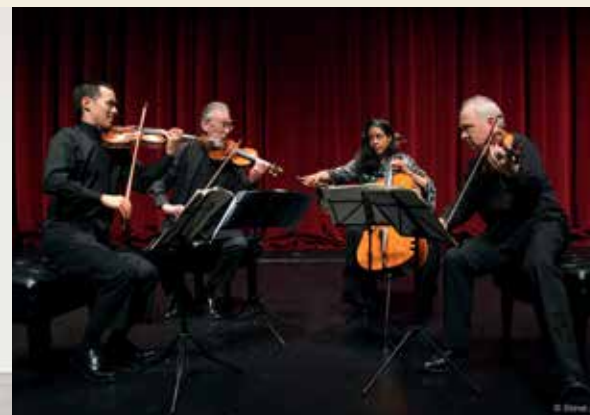
Juilliard String Quartet