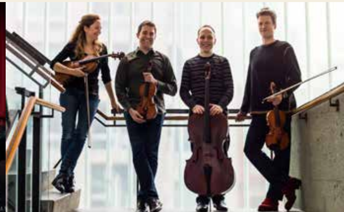
St. Lawrence String Quartet

Established in Toronto in 1989, the SLSQ has won numerous awards at international competitions, and earned Grammy nominations and Juno Awards. The Quartet is also known for its ‘partnership’ with Haydn. Again, The New Yorker : “No other North American quartet plays the music of Haydn with more intelligence, expressivity and force...”