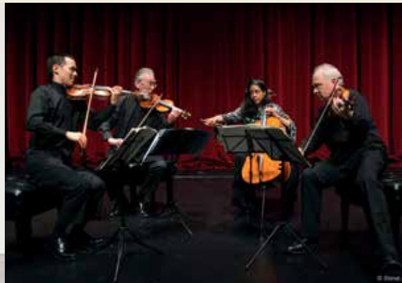
Juilliard String Quartet