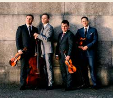
Jerusalem Quartet