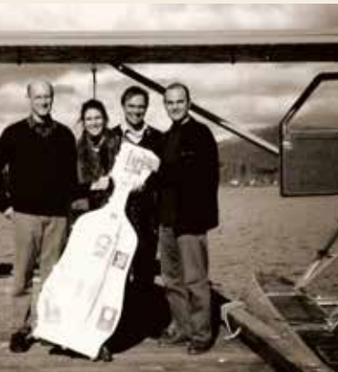
Jerusalem Quartet