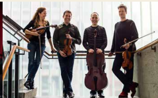
St. Lawrence String Quartet

Established in Toronto in 1989, the SLSQ has won numerous awards at international competitions, and earned Grammy nominations and Juno Awards. The Quartet is also known for its ‘partnership’ with Haydn. Again, The New Yorker : “No other North American quartet plays the music of Haydn with more intelligence, expressivity and force...”