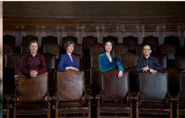
Brentano Quartet