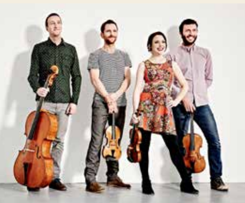
Heath Quartet