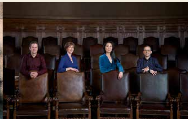
Brentano Quartet