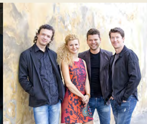
Dover Quartet