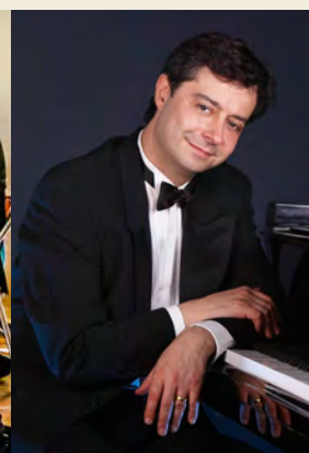
Zodiac Trio