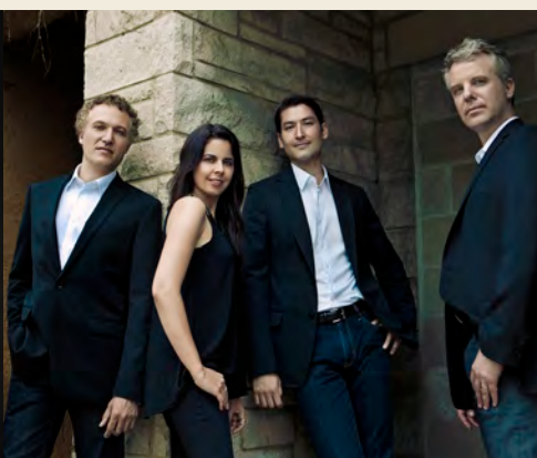
Pavel Haas Quartet