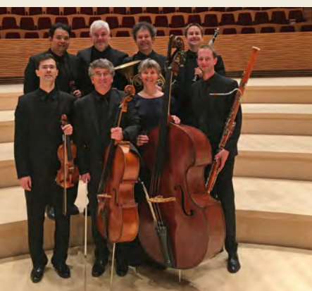
Academy of St. Martin in the Fields